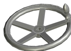
Ratchet handle type 21/25